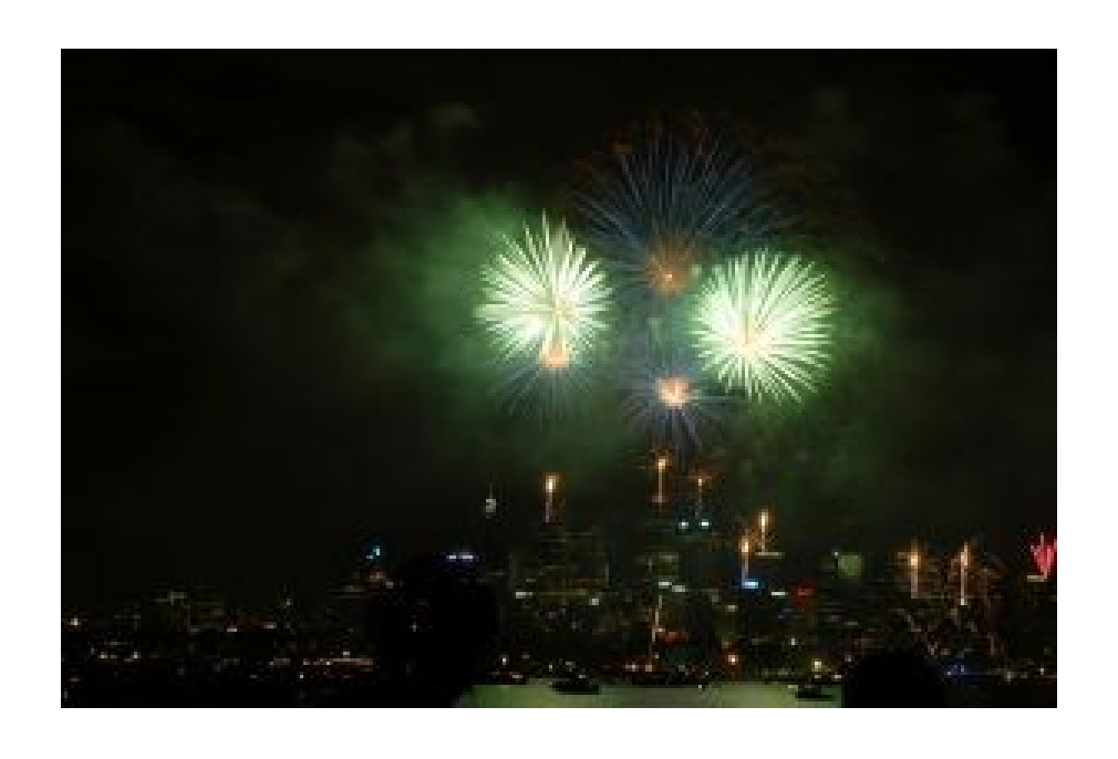
Sustaining The New Year's Resolutions

For thousands of years and in many countries around the world at the end of the calendar year, people have reviewed areas of their lives and their own performances to ascertain sections that need improvement and have drawn up New Year resolutions. It is interesting that globally the end of the year is seen as linked with review and change. Fresh beginnings and improvements for the year to come are something to shoot for.